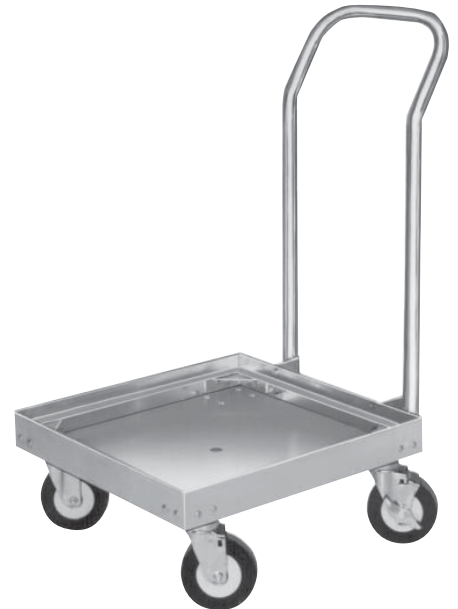
500-2020 (Shown with accessory handle)